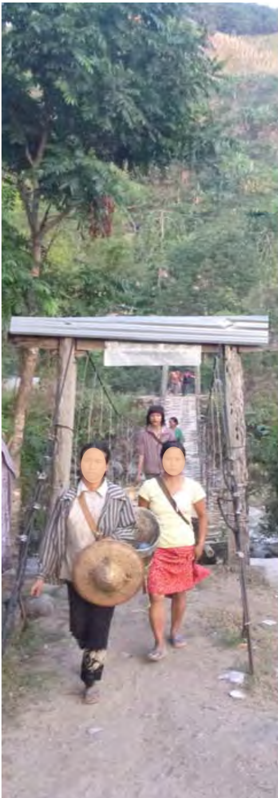
Caught in the middle: Kachin IDPs cross a bridge linking their IDP camp to China.