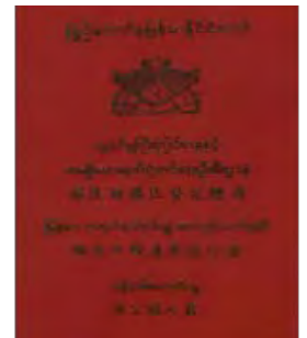
Hard to pass: Border passes for legal travel are nearly impossible for IDPs to access