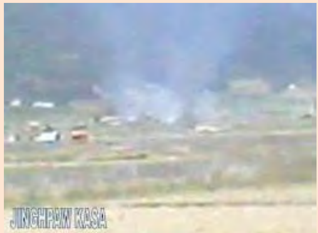
Nowhere to go: Video scene showing Hpaikawng IDP camp burning.

Without legal documents or official protection, the more than 300 villagers who have fled into China to escape invading Burma Army troops are at extremely high risk of being exploited or trafficked.