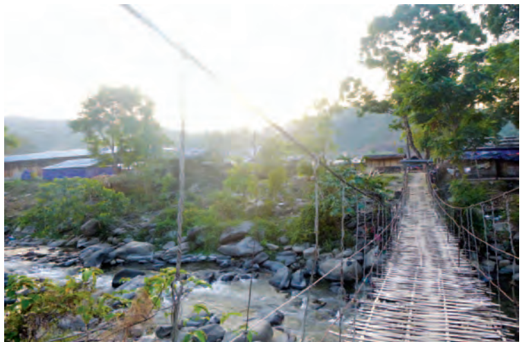
The way across: A wooden bridge links a camp to China

The 17-year-old daughter of an IDP woman was persuaded by her uncle to travel to China while her mother returned back to her village. She ended up being sold as a bride to a Chinese man. Her mother described what happened: