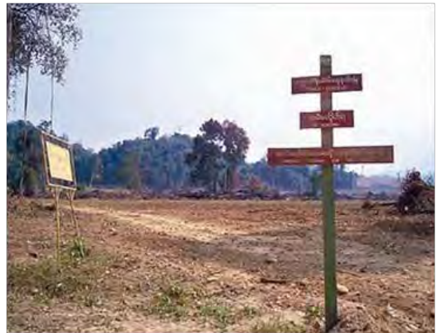
Clear-cut destruction: Lands in the Hukawng Tiger Reserve in Kachin State, including small local farms, were confiscated and razed to make room for commercial sugarcane, tapioca, and jatropha plantations.

Today, the same factors contributing to the problem of trafficking remain, but are exacerbated by the presence of conflict and the massive displacement that has resulted from it.