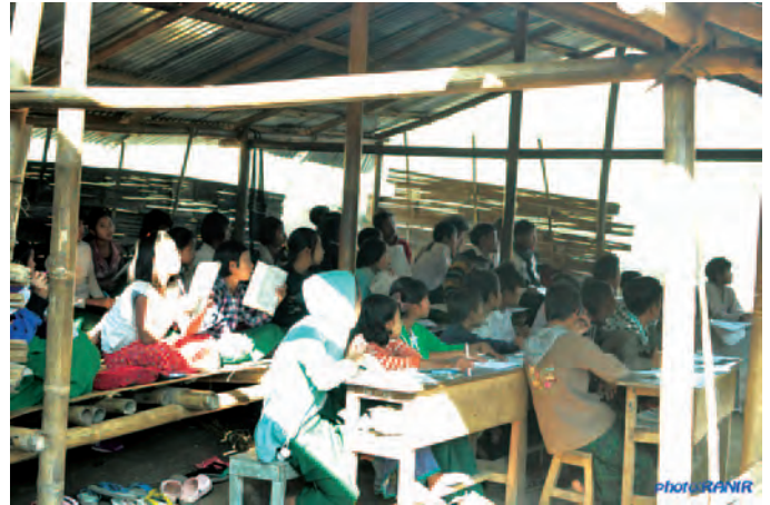
Close quarters: IDP children gather for their studies

This has been a disincentive for children to attend school. According to the mother of the 11-year-old IDP girl who went missing on the China side: