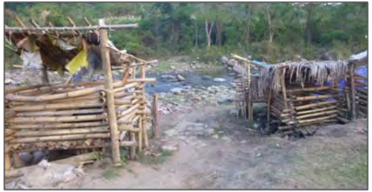
A stone's throw away: Informal border crossing from an IDP camp to China

The inability for most IDPs to access border passes to legally look for work in China is a major risk factor for human trafficking.