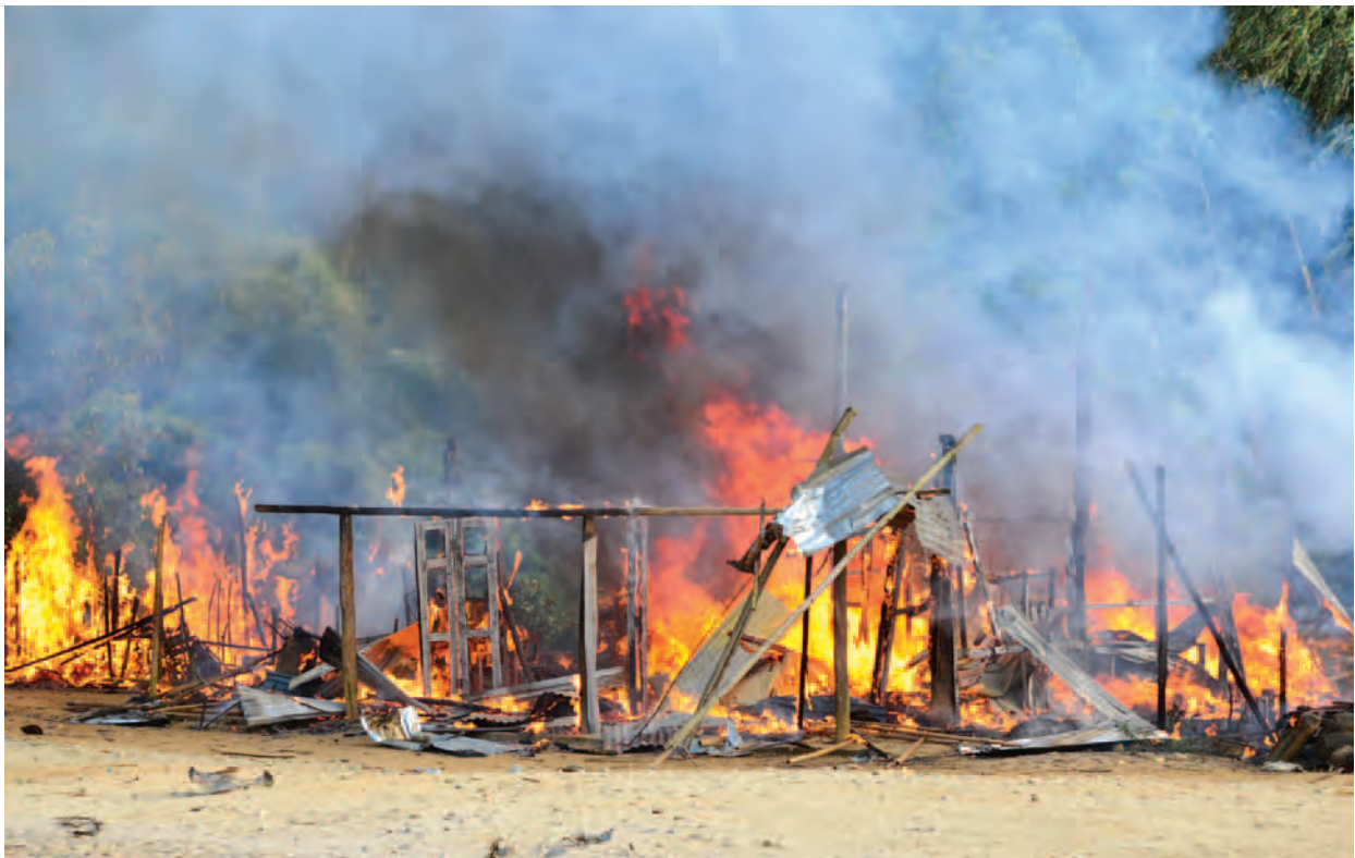
Burma Army air strike: A house in Kachin State burns after being hit by a bomb dropped by Burmese Army forces.