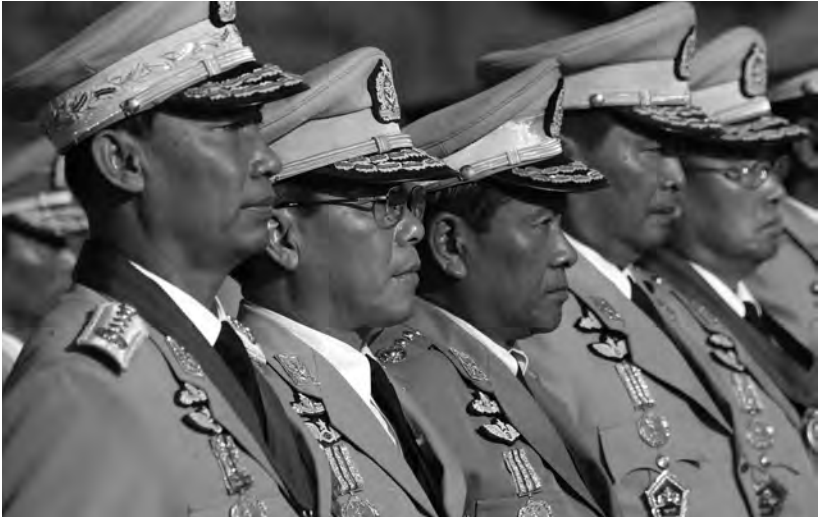
The ruling generals of the Myanmar government look on during Armed Forces Day on Sunday, March 27, 2005, in Yangon (AP Photo/David Longstreath).

group. But he did not have much to work with. The United States, having fired another sanctions salvo in June 2003 with little effect, had returned to its default position of non-engagement apart from regular symbolic statements of protest over Aung San Suu Kyi's continued house arrest and condemnation of the National Convention. The EU was hesitant both to apply more sanctions, which it worried would simply hurt Myanmar's ordinary people, and to attempt further engagement that would be politically costly with domestic constituencies. ASEAN at this point was largely behind the SPDC's roadmap and basically inclined to wait and see where the National Convention would lead. Thailand, in December 2003, had convened a meeting of ten like-minded member states in Bangkok to discuss ways to encourage more inclusive processes within the context of the roadmap, which was the first of any such international meetings that included Myanmar. There was some talk about further meetings in what was dubbed the "Bangkok Process," but it all fizzled out. The Western participants were widely criticized by pro-democracy groups for even participating, and Myanmar subsequently let it be known that it was unwilling to return except to report on subsequent steps of the roadmap.