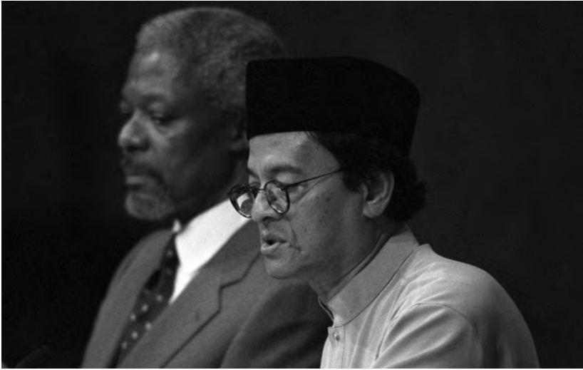
Secretary-General Kofi Annan and Razali Ismail.

little more than “just go there and observe how things were going.” 2 Alvaro de Soto’s end-of-assignment report was given to him as a handover note. With little involvement of the Secretary-General and the Secretariat, the envoy and his team were left to their own devices. Nothing was prepared in advance of his first trips. Plans were made as they went.