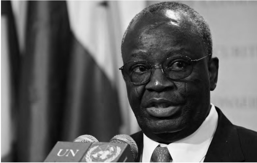
Ibrahim Gambari.

Myanmar context than the previous envoy. Also important for the protocol-conscious Myanmar leadership was that, as Under-Secretary-General, Gambari had a higher rank than any of the previous envoys.