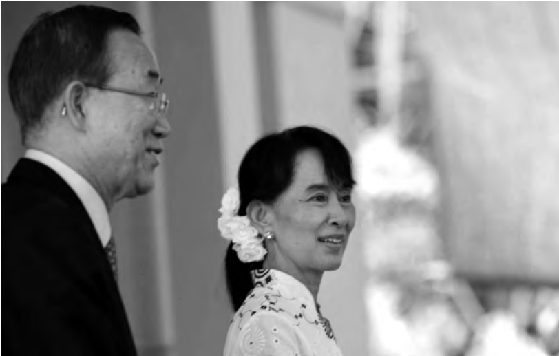
Secretary-General Ban Ki-moon at a joint press stakeout with Aung San Suu Kyi, Yangon, Myanmar, May 1, 2012.

than 80 percent of the vote. In May she took her seat in Naypyitaw as a new member of Parliament (MP).