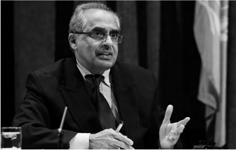
Vijay Nambiar.

meeting of heads of UN agencies to develop a common platform for “system-wide engagement on socio-economic and development issues,” consistent with the three-pillar approach. 3 A later request to visit Myanmar in August was rejected by the government.