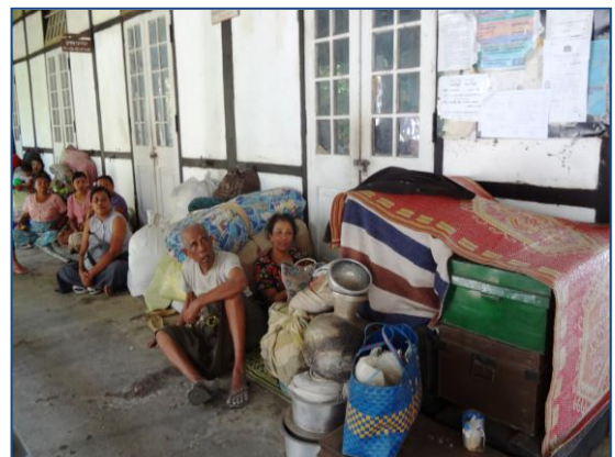
People in Ramree waiting for assistance

As of 31 October, the Rakhine State Government estimates that 35,058 people have been displaced in Kyaukpyu, Kyauktaw, Minbya, Mrauk-U, Myebon, Pauktaw, Ramree and Rathedaung. It has also been announced by the Office of the President that 89 people have been killed, 136 injured and 5,351 private and public, including religious buildings were burned or destroyed during the resurgence of the violence. Some people fled to areas close-by their villages; other groups – especially from Pauktaw and Kyaukpyu - left by boat and landed in some locations, including in Sin Tet Maw in Pauktaw Township, and Thea Chaung and Ohn Taw near Sittwe.