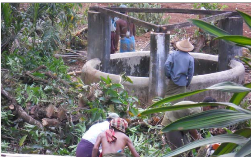
Well-cleaning development project in Kyautalin village

The projects were designed to address the specific needs of each village. For example, the project to wash out the well was endeavored to improve local health by making clean drinking water accessible to the community. The project to insulate the school roof was developed to allow students to be able to study in the rainy and summer seasons. Now, teachers and parents do not need to worry about students getting heat sickness under