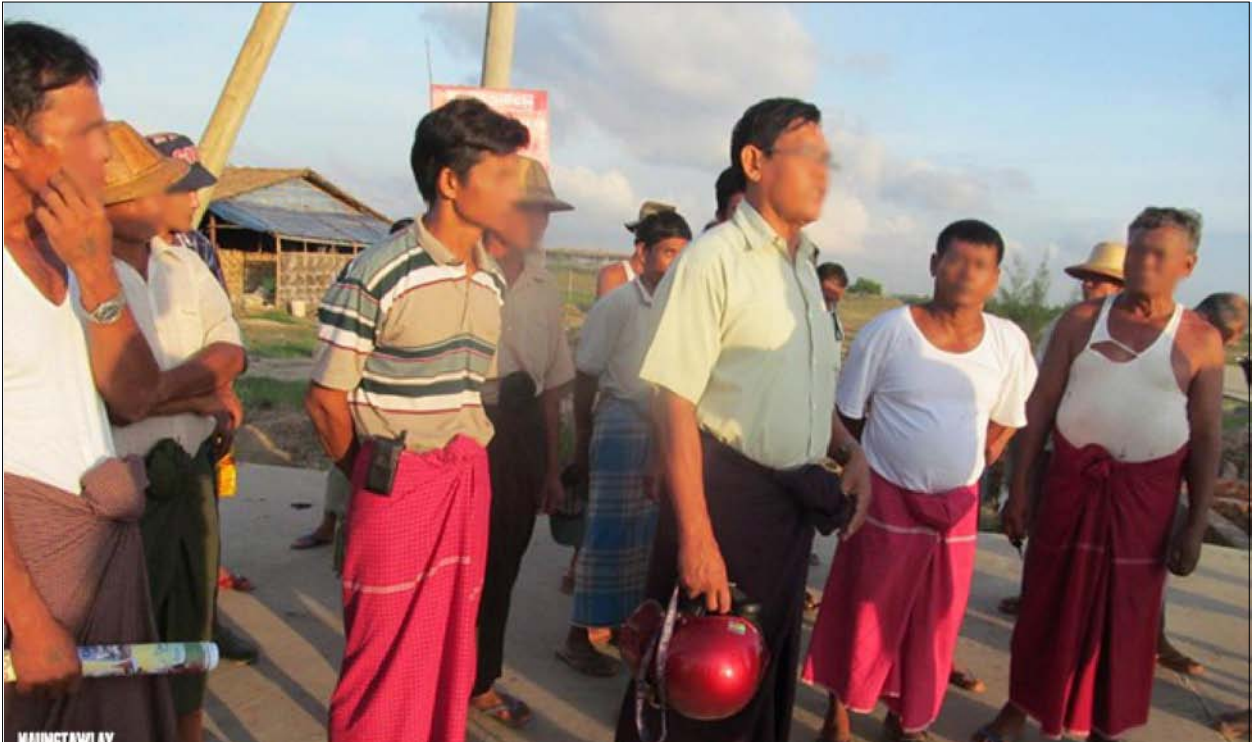
Mon farmers observing their lands confiscated by the Zay Ka Bar Company in May 2012

In order to construct industrial zones 1, 2, and 3, the Zaykabar Company leveled the farmland by destroying its embankments, constructing a motorway and lampposts, and carving some parts of the land into housing plots for sale.