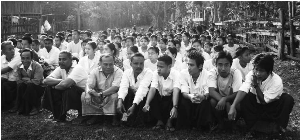
USDP members gathered for a meeting, Kyaik Mayaw Township, Mon State, July 2010