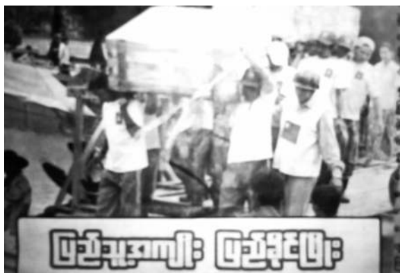
USDP built a road to buy votes and forced residents to support the Party, Mon State