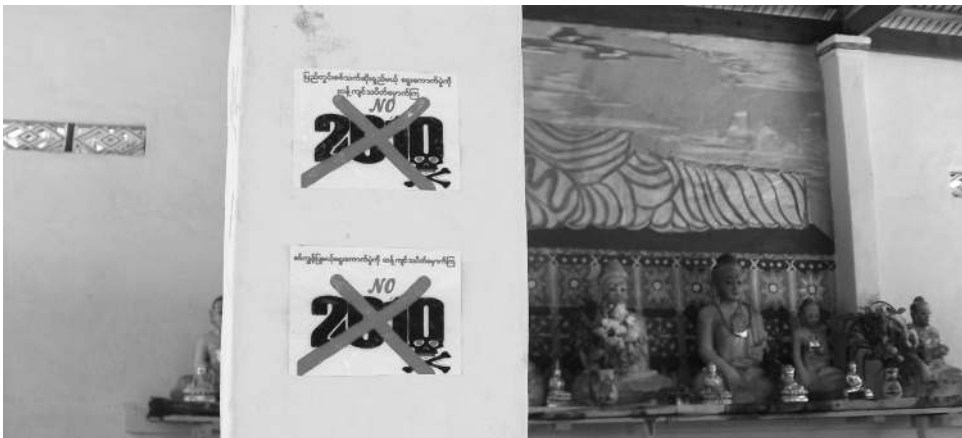
In some areas, villagers demonstrated against the elections and displayed "No Vote" posters, Karen State

“All of our neighbors received the papers required to vote but we didn’t get any. Polling station officials asked me if I could go to the polling station on the Election Day and even though I replied that I doubted I could, I wasn’t given any paper for advance voting. Without the paper, I couldn’t go to the polling station, couldn’t get a ballot and couldn’t vote. So, I lost my right to vote for the first