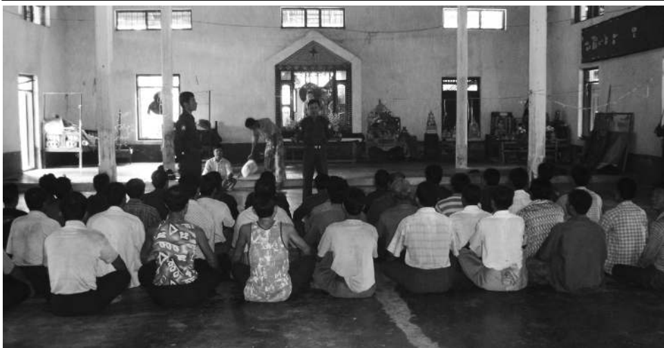
Training of Militias in preparation for the Election Day, Mon State

“You might be arrested if you do not vote tomorrow on Election Day.” 22