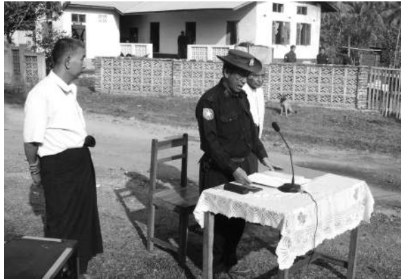
The army commander from the front line troops organized a public event with USDP members to urge villagers to vote for USDP in Kawkareik, Mon State

On 17 September 2010, by the order of U Khun Myat, five militia from Kalan Militia Base led by the second in command U Win Myint arrived at Panlau village, Honaung village group and threatened U Ei San and other TNP members who were campaigning in the village with the permission of the Township Elections Commission. U Ei San and the other TNP members were told to stop the canvassing and get out of the village.