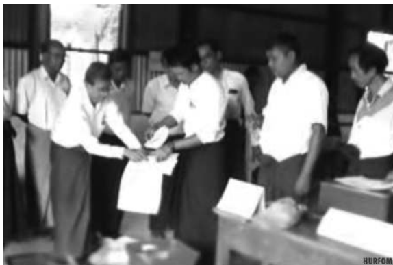
Polling Station Officers add early votes after the closure of the polling station, Mon State

Mae Kaw Wan Middle School in Mong Ko village, Tachileik township, was closed before the elections - from 1 to 5 November, 2010 - because the school was used as a polling-station. People from Mae Kaw Wan and 13 surrounding villages were designated to vote there, so there were more voters than the station could handle. U Chan Mya, a local USDP leader, ordered all people including government employees and Christian religious leaders (except senior pastors in Christian villages) to cast their votes on Election Day. Village heads were officially instructed to help voters coming from surrounding villages to cast their ballots, but people did not have any convenient place to wait.