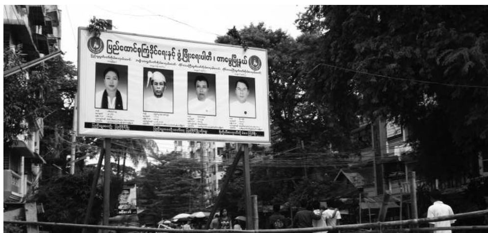
USDP campaign poster in Yangon. During the campaigning period, opposition parties were not allowed to campaign freely. The election law restricted their rights to campaign and freely distribute campaign materials, such as leaflets and posters