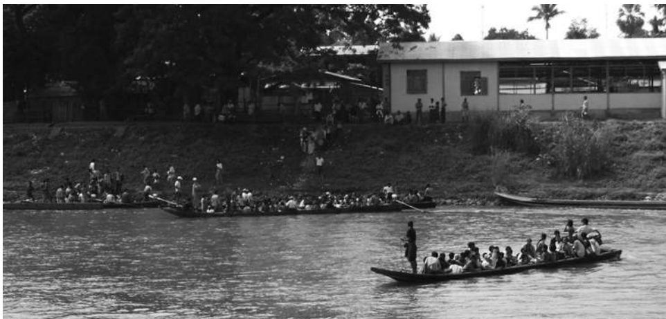
Villagers fleeing the fighting after the Election Day - 8 November 2010