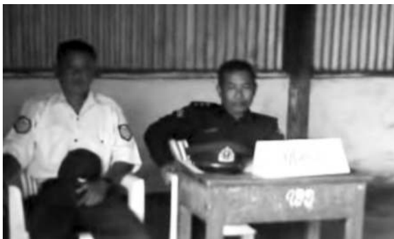
Local Authorities told residents to vote for the USDP, Mon State

Day. Problems with and misuse of voter lists observed during advance votes also continued on the day of the elections. In Rangoon Division, Tanyin Township, some voters went to the polling station to vote but they did not have voting tokens so were not allowed to vote. They brought ID with them but were still not allowed to vote. The Chief of the polling station in Kamano village, Mon State did not allow villagers to vote saying that their names were not on the eligible voters lists, even though villagers had IDs. In Mong We and Mong Pu villages in Namkham township, Northern Shan State, a resident stated that a USDP organizer kept 500 ballots in case USDP needed them. The same organizer illegally forced children to vote for him and made some people to cast duplicate votes on his behalf. 60 At polling-station No. 2 in Aung Metta Ward, Shan State, a candidate gave 7500 kyat to 150 people to vote for him; and on Election Day more people voted than were on the voter lists—over 150 more than the actual 4068 eligible voters. 61