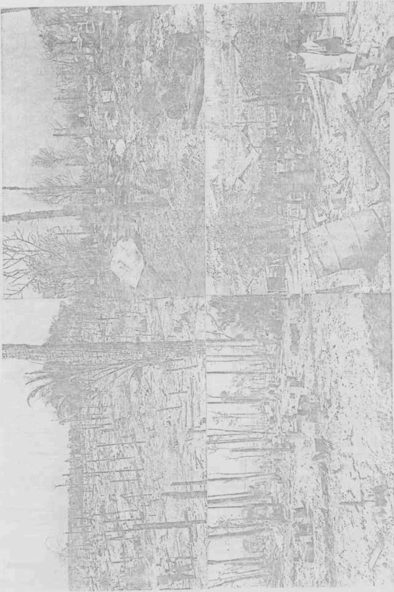
This reflects the ever dangerous, difficult situations Karen civilians face on the side of the border