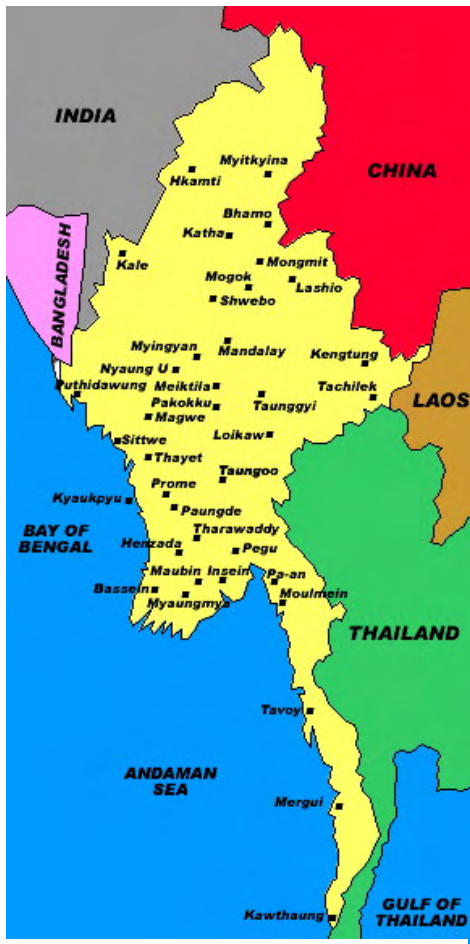
Map of prisons in Burma

One of the major concerns for Burma's political prisoners right now is the impact of prison transfers. The medium to long-term effect of prison transfers on political prisoners' health is likely to be very serious, and may directly result in more deaths in prisons.