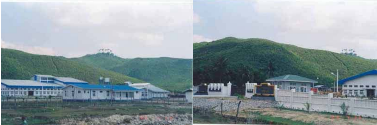
Gas pipeline, crossing on the private farm near Zarthabyin & Pa-an road, Kyeikmaraw Township, Mon State