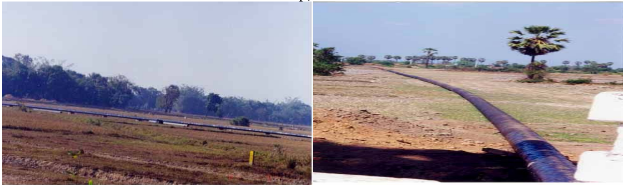
Gas pipeline crossing on private farm, Nyaungbinseik & Kyawechangone village, Kyeikmaraw Township, Mon State